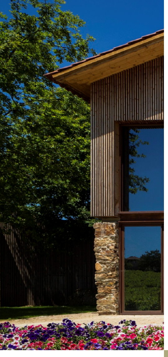
1. BE AWARE OF THE RISKS WHEN TRAVELING AND TAKE THE NECESSARY PRECAUTIONS.

When planning your trip, make sure you know the characteristics of the destination you want to know and take the necessary measures to have up-to-date documentation, such as insurance and health data that may be requested. In addition, follow the recommendations of local authorities at all times, especially in case of an emergency. Check the composition of the products you consume to avoid any risk, especially those that may arise from allergic reactions or intolerances.