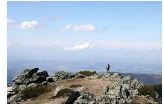
[Miradouro de Nossa Senhora de Moreira]

Plan your refuge in nature by visiting the Serra do Marão. You will deflower a heritage constituted of beautiful forest spots, we will explore the highest places with breathtaking landscapes and passing by the viewpoint of Nossa Senhora de Moreira, where we feel insignificant such is the beauty and vastness of everything that surrounds us and that draw the landscape.